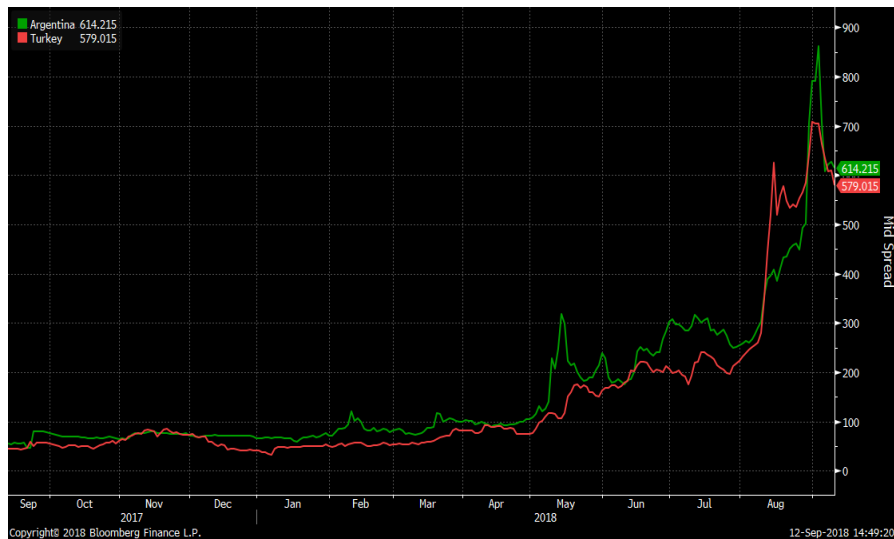
CHART 3: CDS Spreads: Argentina and Turkey (Sep.12, 2017 – Sep. 12, 2018)

The rapid increase in the cost of default protection reflects a genuine fear that the significant depreciation in these countries' currencies will make it substantially more difficult for them to meet their US dollar-based obligations