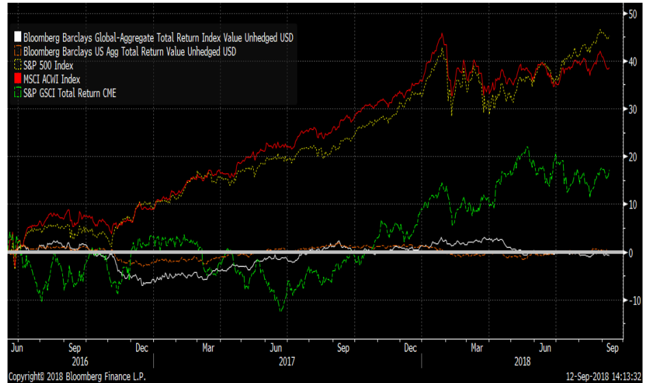
CHART 2: Asset Class Performance since Inflation Trough (Jun. 15, 2016 – Sep. 12, 2018)

For Index descriptors, see "Index Descriptions" at end of document