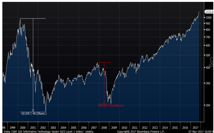
CHART 3: S&P 500® Technology Index (Weekly from Sep 1997 – Nov 7, 2017)